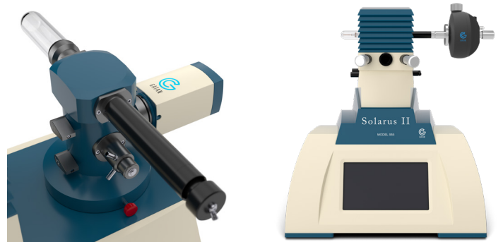
Figure 3. The image shows a single pumping station module installed on the Solarus II system (left) as well as with the Elsa™ holder connected (right).